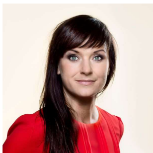
— Sophie Løhde, Danish Health Minister and Minister for the Interior

“ Today, we have taken an important step towards ensuring that European patients have access to the medicines they need. The critical medicines act will strengthen the availability of vital medicines, reduce shortages, and build a more resilient supply chain for critical health products across Europe.